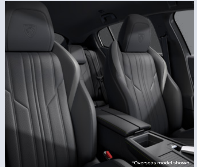
Leather seat trim 4