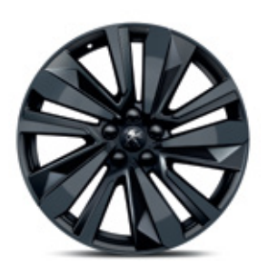
19" Washington onyx black finish diamond cut alloy wheels (Standard on GT SPORT)