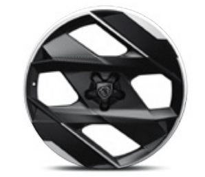
20" Monolithe diamond cut alloy wheels