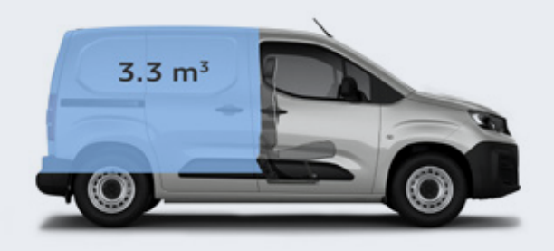
SHORT WHEEL BASE