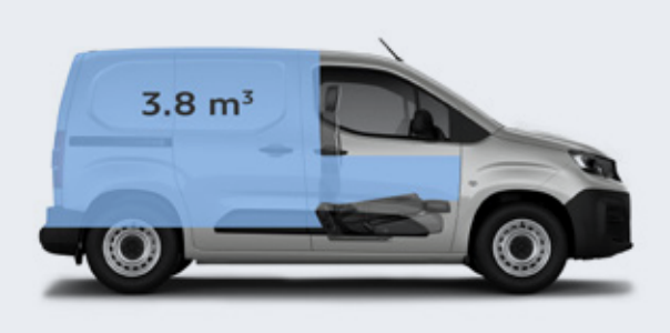
SHORT WHEEL BASE WITH MULTIFLEX BENCH