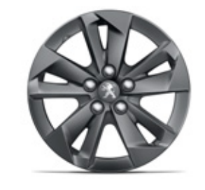
16" Taranaki alloy wheels (Standard on Premium SWB & LWB Auto)