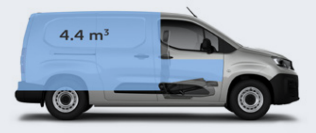
LONG WHEEL BASE WITH MULTIFLEX BENCH

1. Cargo bay dimensions quoted at maximum length, and are provided for guidance only. The cargo bay is an asymmetric shape and dimensions are therefore variable. Customers must check critical dimension requirements by measuring vehicle.