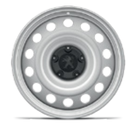
16" Steel wheels (Standard on Pro SWB & LWB Auto and e-Partner Auto)