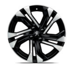
17" Salamanca diamond cut alloy wheels (Standard on Allure & GT)