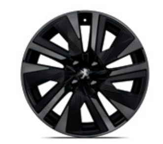
18" Evissa onyx black alloy wheels (Standard on e-2008 GT)