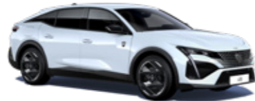
OKENITE WHITE 1