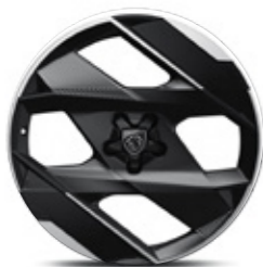
20" Monolithe diamond cut alloy wheels

Note: Paint colours are representative only and subject to variation due to the printing process. 1. Optional extra