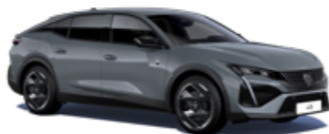
SELLENIUM GREY 1