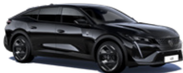
NERA BLACK 1