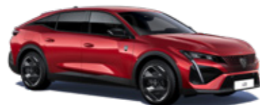
ELIXIR RED 1